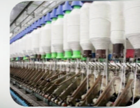
Venkatesa Lakshmi Spinning Mills