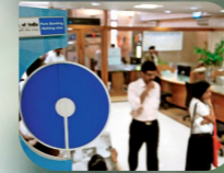
State Bank of India