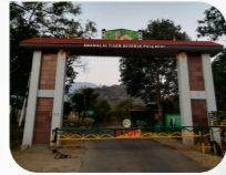
Annamalai Tiger Reserve