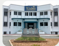
Wisdom College of Management