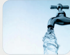
24/7 Water Facility