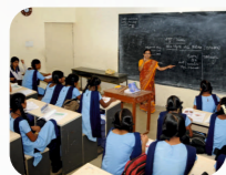
Poolamkinar Government School