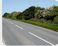
Black top Road