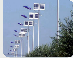
Solar Street Light