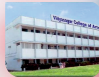
Vidhya Sagar College of Arts & Science