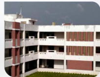
Vidhya Nethra Matric School