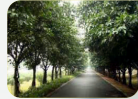
Road Side Trees