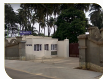
Palani Andavar Mills