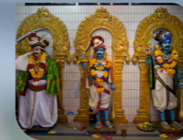
Madurai Veeran Temple