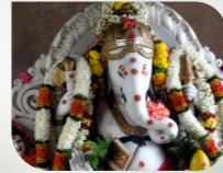
Muthu Vinayager Temple