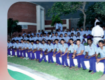
Suguna Institute of Poultry management