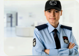
24/7 Security Service