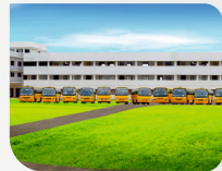
Kamalam College of Arts & Science