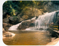
Thirumurthi Water Falls